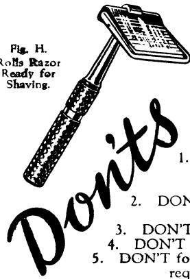
Fig. H. Rolls Razor Ready for Shaving.

The Rolls Razor Blade is hollow ground and made of Sheffield Steel. The Blade Guard is attached to the Blade and must not be removed. In the Stropping operation the Blade is pulled along the Strop, whilst in Honing it is pushed against the Hone. The Strop is the RED LEATHER and should be kept fully impregnated with Rolls Razor Strop Dressing. The Hone is the GREY STONE, and is used dry.